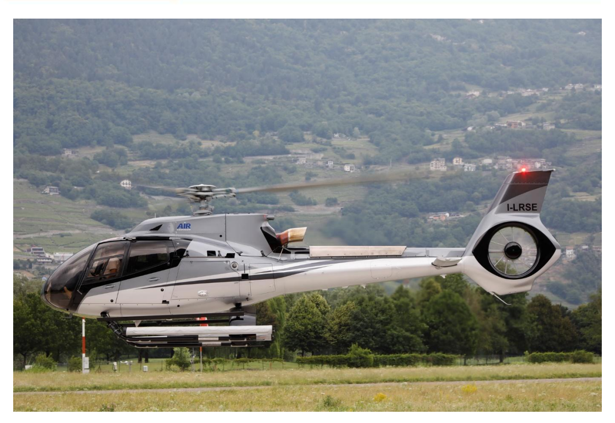
ACH130 of Air Corporate